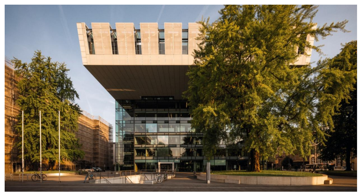
The Super-C is one of the central buildings of RWTH. It got its name from its unusual shape, which looks like a C from the side

Module M05 of the EECI International Graduate School on Control 2023 takes place at RWTH Aachen University. With more than 45,000 students, RWTH is the largest technical university in Germany. RWTH is not a classic campus university. The university and its various departments are spread across the entire city on three, soon to be four, smaller campuses. The computer science department is located on the Hörn campus.